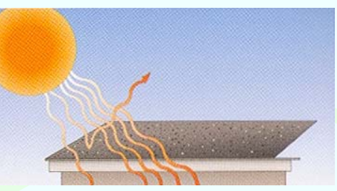
An uncoated roof can absorb up to 83% of the sun's heat and UV rays.